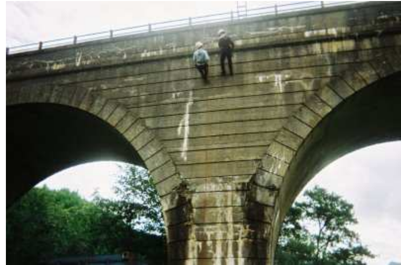
Explorer Scouts in action again