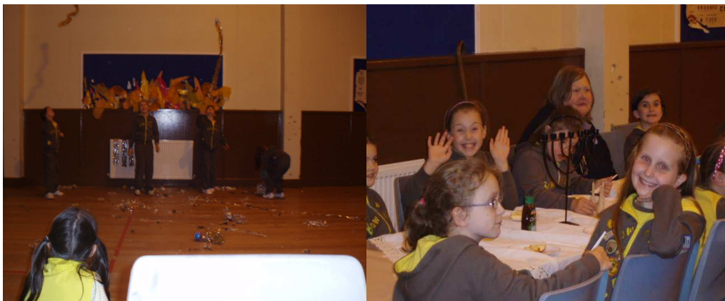
Bonfires and wreaths

Thanks again to the congregation who are always very supportive and to the Boys Brigade who once again put the tables out for us on the Friday before our coffee morning which saved us from either setting up very late on Friday night or having to come in very early on Saturday morning.