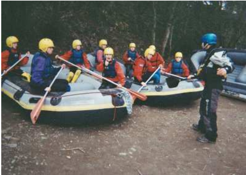
Top picture the Scouts - West Highland Way