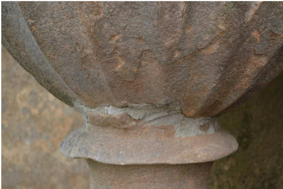
A close up of the problem