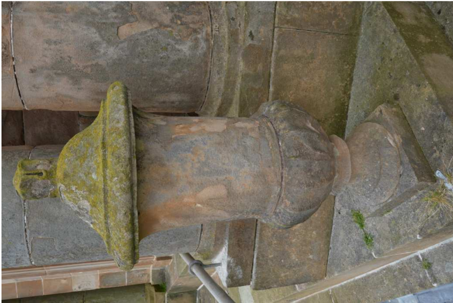
This is the Urn needing attention